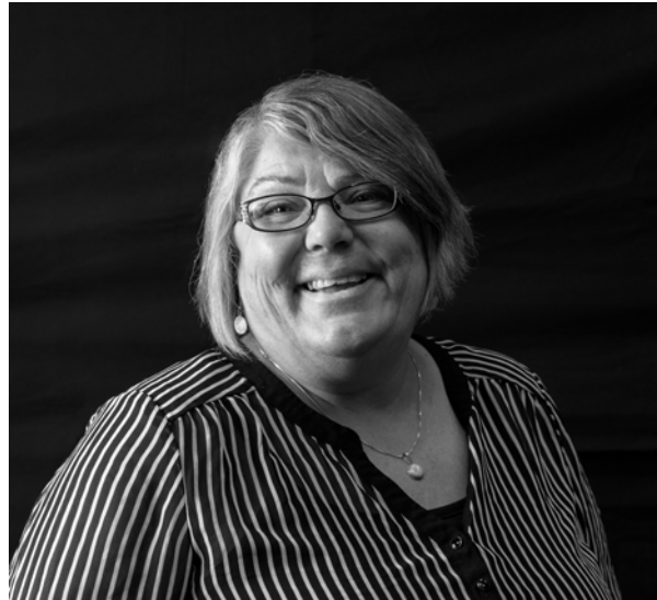
DEBBY WHITE VOLUNTEER OF THE YEAR, 2016 SCARBOROUGH REGION