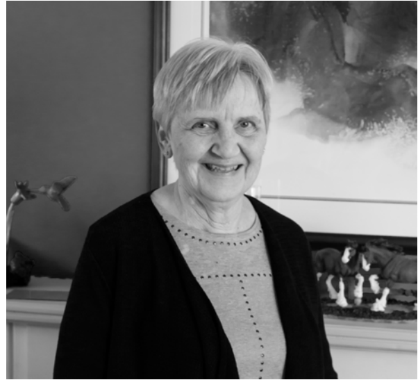
MARY BYNE VOLUNTEER OF THE YEAR, 2016 ETOBICOKE/YORK REGION