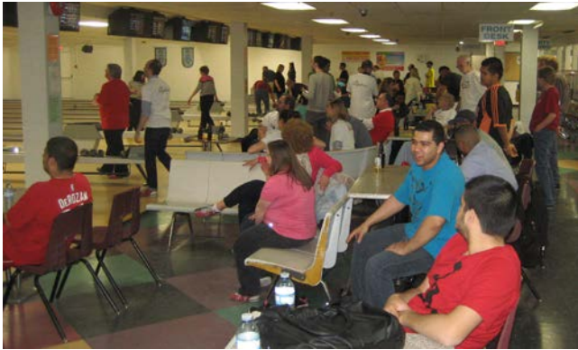
A fun evening of bowling in 2016!

We are calling all bowlers, fun seekers and general enthusiasts. The 7 th Annual Bingo Bowling Extravaganza will be held on Sunday May 7, 2017 at 2pm. Registration will begin at 1:30pm. This is a wonderful family event, enjoyed by all.